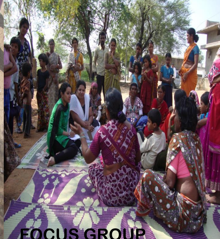
FOCUS GROUP INTERVIEW